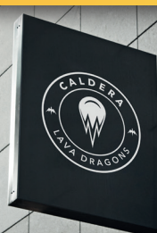
Signs & Graphics