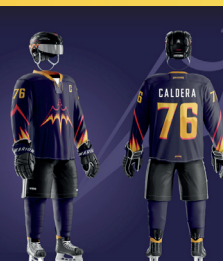
Custom Sports Apparel